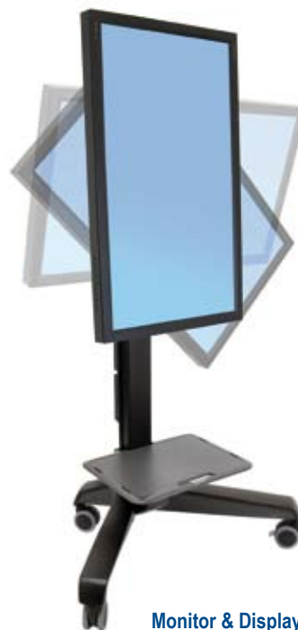
Monitor & Display not included