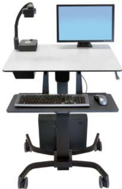
Monitor & Accessories not included