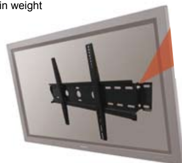
Accessories not included

ALL ORDERS OVER $250 (EX GST) DELIVERED FREE