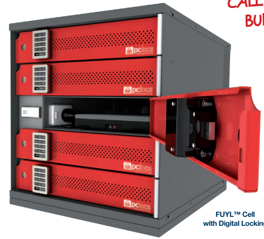
FUYL™ Cell with Digital Locking