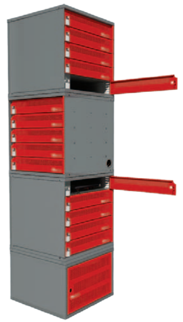
FUYL™ Station (3 x FUYL™ Cells + Pedestal)